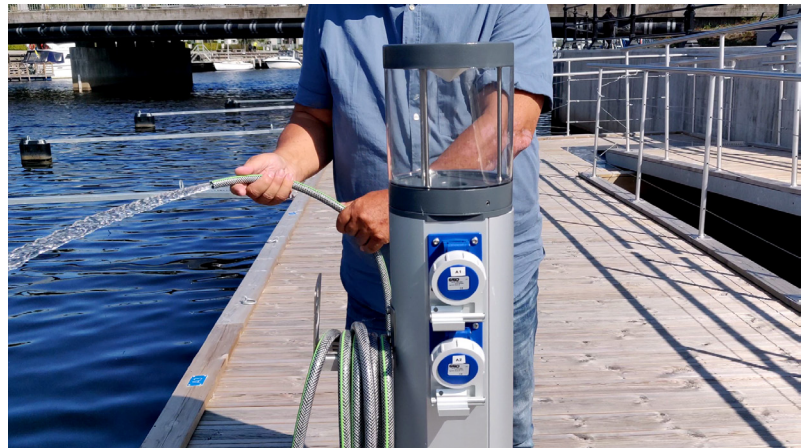
Poles for electricity and water in Gävle city port.