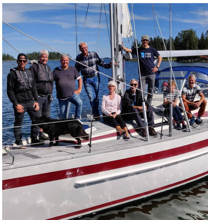
Filming crew in Gävle.

A sneak peek of the videos was given during the workshop held in Mariehamn. The publication of the rest of the edited material will be done during the next months and the videos will be part of PortMate ICT-tool.