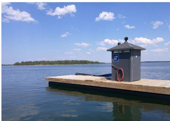
Transportable septic wastewater emptying system in Kuuskajaskari island in Rauma.