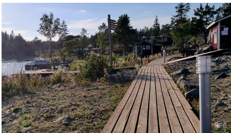
New led lights along the path in Fyrhamn port in Storjungfrun island.